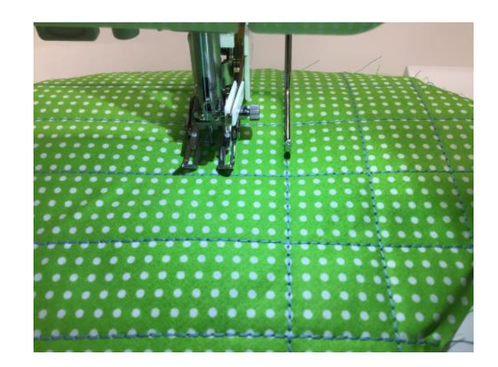
Step 4 - 9 Same as Pink Bucket.

When stitching all one way is done, mark the cross 45° line to create a cross hatch stitching pattern on the fabric. Stitch.